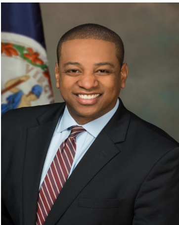
Justin E. Fairfax Lieutenant Governor Commonwealth Of Virginia