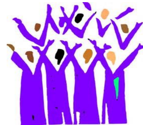
Recognizing Historically Black Churches in Fairfax County

For information on how to reach this location using public transportation contact the Fairfax Connector at 703-339-7200, TTY 703-339-1608, or visit their website at www.fairfaxconnector.com . You may also contact the Washington Metropolitan Area Transit Authority at 202-637-7000, TTY 202-638-3780, or visit their website at www.wmata.com .